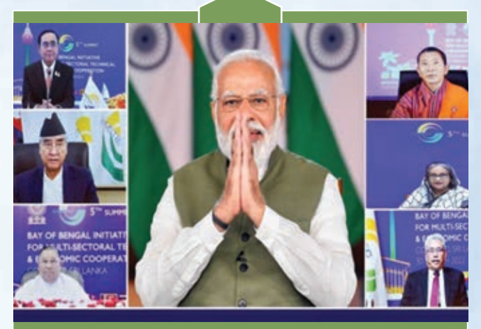
MoUs signed with BIMSTEC Member States