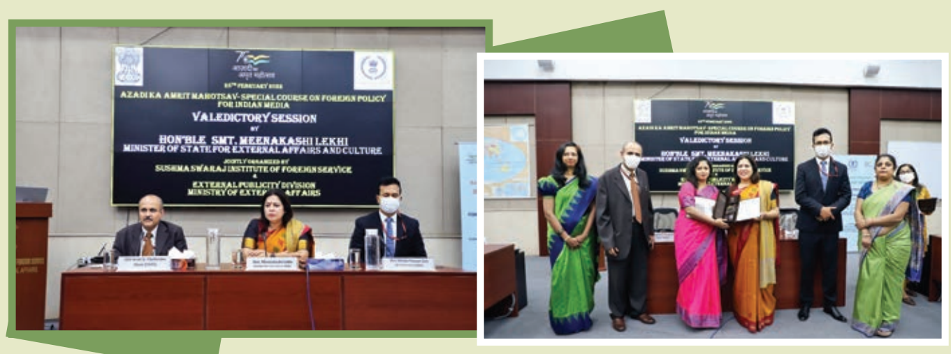
Minister of State for External Affairs & Culture, Smt. Meenakshi Lekhi graced the Valedictory Ceremony