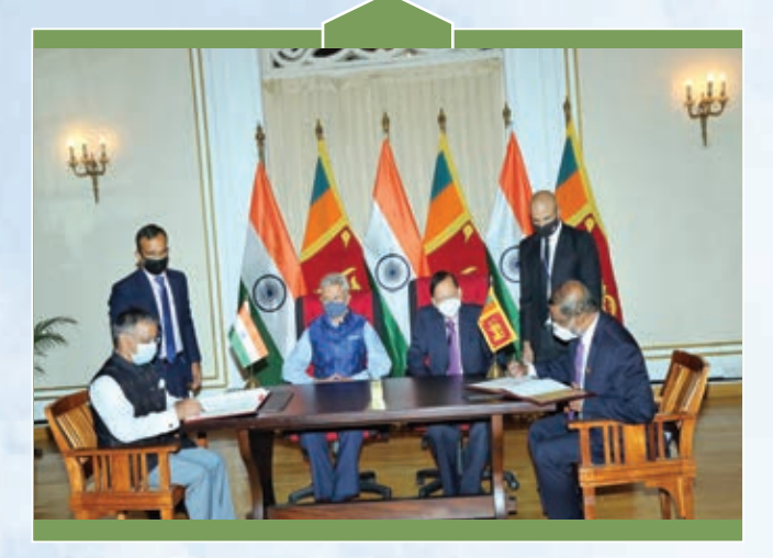
MoU signed with Sri Lanka