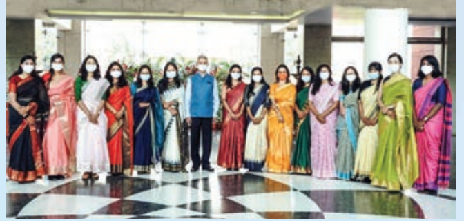
EAM with women IFS OTs 2021 Batch