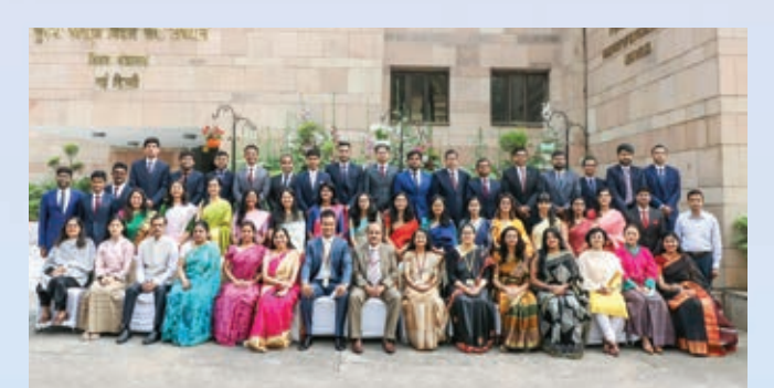
IFS OTs 2021 Batch with Team SSIFS

The Induction Training Programme (ITP) for thirtyfive Indian Foreign Service Officer Trainees (IFS OTs) of the 2021 batch and two diplomats from Bhutan commenced on 21 March 2022. The inaugural module of the ITP, conceptualized as an exercise to familiarize the officers with the structure and function of the Ministry and its highest offices, was held from 21-25 March 2022 as the 'Orientation Week'. During the Orientation Week,