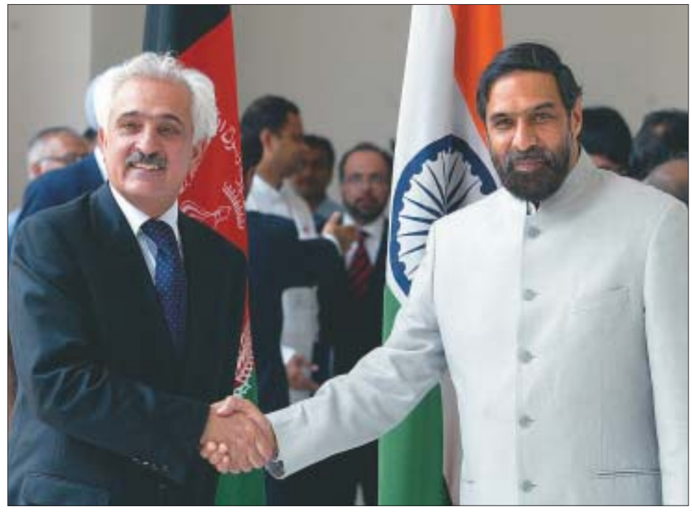
Minister of Foreign Affairs of Afghanistan Dr. Rangin Dadfar Spanta with Minister of State for Foreign Affairs Anand Sharma prior to a meeting in New Delhi on June 30.

Later, on July 1, Spanta delivered a talk on Afghanistan's foreign policy at the Indian Council for World Affairs (ICWA) before leaving for home.