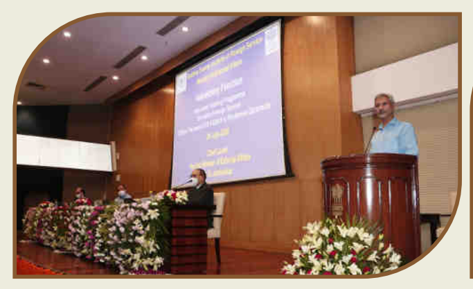
EAM addressing the IFS OTs

A valedictory ceremony was organized on 24 July 2020, which was presided over by Dr. S. Jaishankar, Hon'ble External Affairs Minister (EAM) as Chief Guest. Shri V. Muraleedharan, Hon'ble Minister of State for External Affairs (MoS) and Shri Harsh V. Shringla, Foreign Secretary participated as Guests of Honour. Awards were given on the occasion to deserving OTs of the 2019 batch.