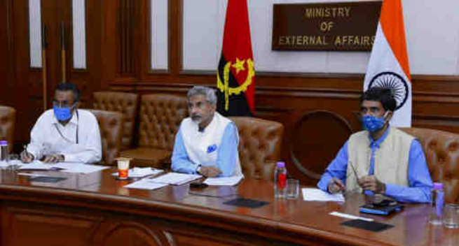
MoU with Angola signed on the margins of 1<sup>st</sup> India-Angola Joint Commission Meeting