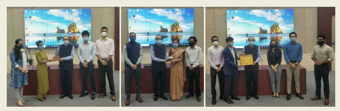
IFS OTs handover insignias to Dean (SSIFS) which were received by the respective groups during their Army Attachments