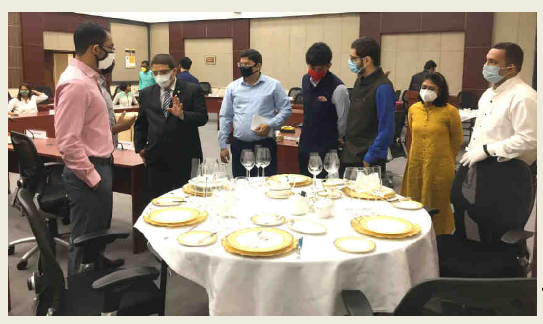
'Workshop on Hospitality' for the IFS OTs conducted at Hotel Taj Palace, New Delhi