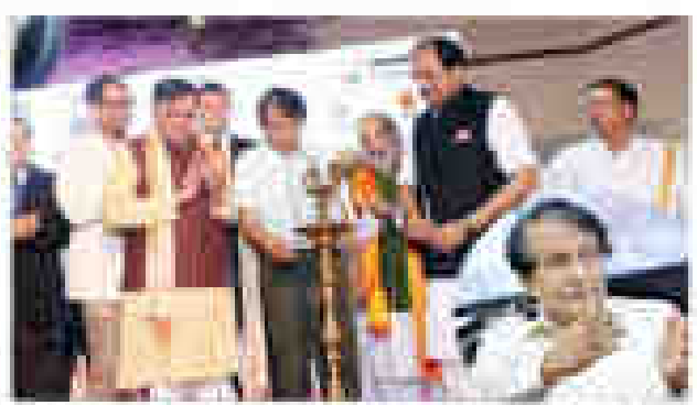
Santo, Franca, Grain, Science of Saltrage, Common & Saltrage and the Salta University Solution Photoster SD in St. Ja. Physics Sci. J. Security Sp. Store