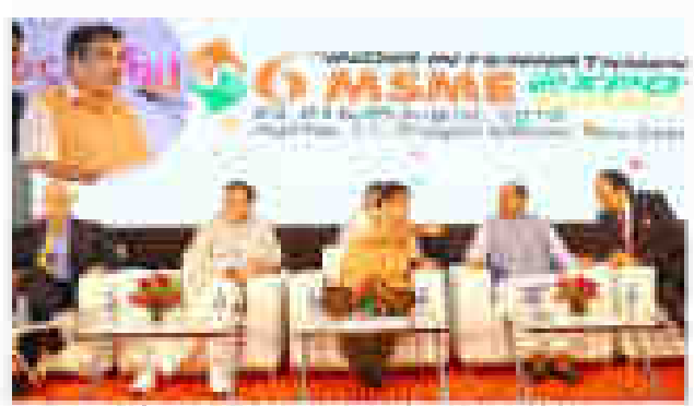
The Nation Contains the explorer Publish and Total Torograph & Adjuster, The Nation Species of Parliament. At Addit Plaintee, Includes Manager plaint The Stat Maria, Assistance for Franch & Superant Descript Charmes HERE