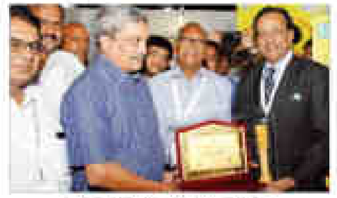
St. Species April 20, Horn Calmi Million of Delicar and St. Specie Control St. L.E. Aggressed