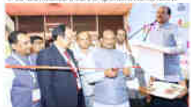
the Day Tally Institute of Public Philippers