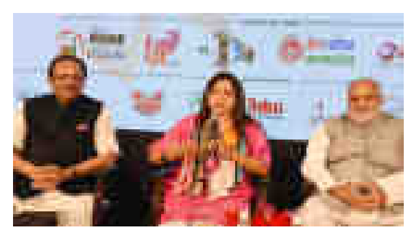
Smt. Meenakshi Lekhi,Minister of State for External Affairs and Culture