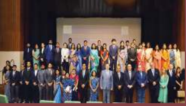
H.E. Mr. Zbigniew Rau, Foreign Minister of Poland visited SSIFS on 25 April 2022 and addressed the IFS OTs and Bhutanese diplomats.