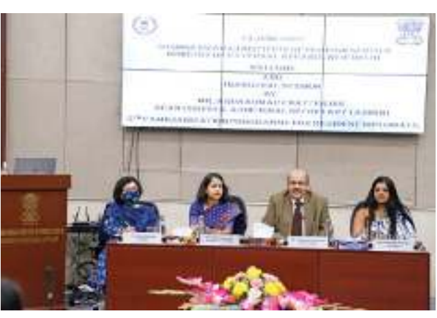
Inaugural session addressed by Dean (SSIFS)