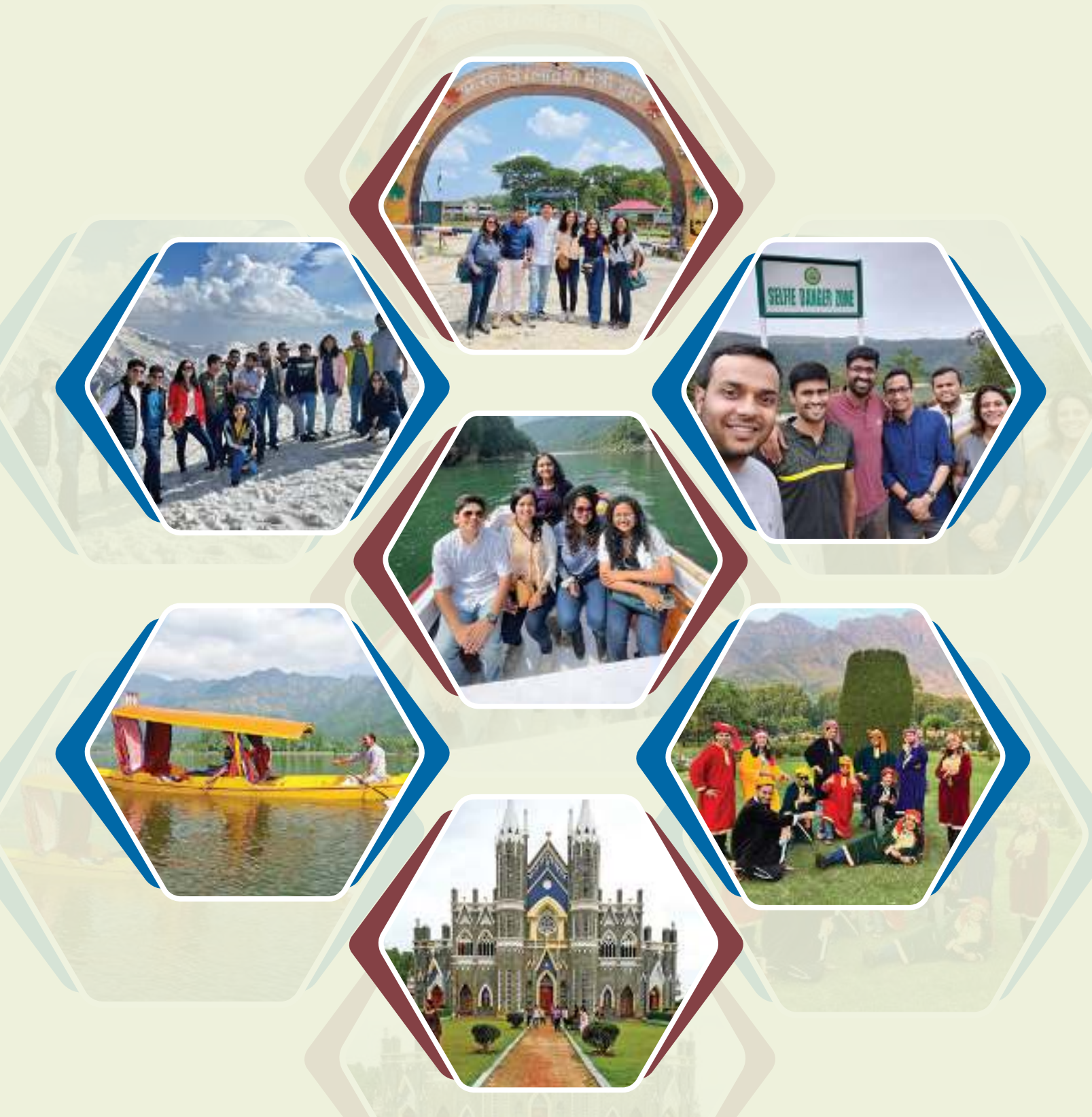
'Incredible India' through the eyes of IFS OTs during their Bharat Darshan