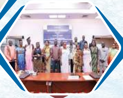
Diplomats from South Sudan in traditional attire