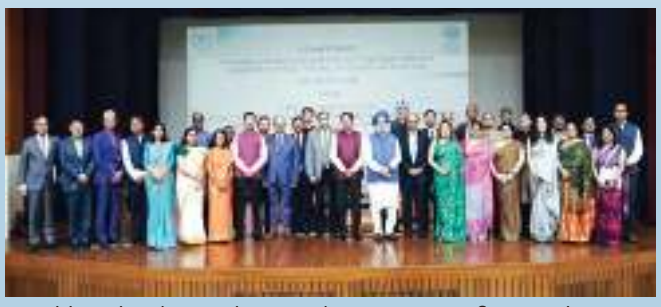
Address by Shri Hardeep Singh Puri, Minister for Petroleum & Natural Gas and Minister of Housing & Urban Affairs