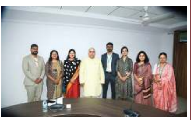
Call on dignitaries during State Attachments (Governors, Chief Ministers & senior officials) by IFS OTs