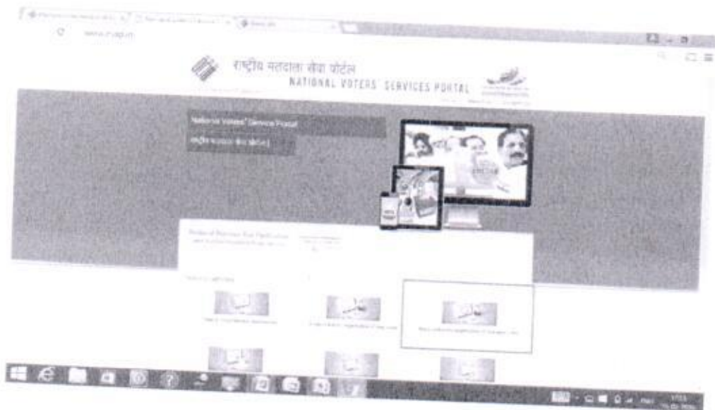
Fig 1.4 Click link 'Apply online for registration of overseas