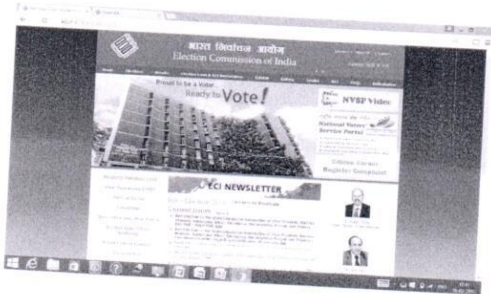
Fig 1.1 ECI website