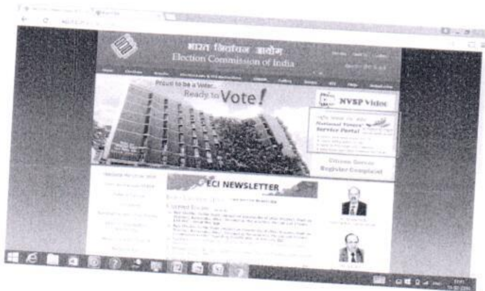
Fig 1.2 Click nvsp link