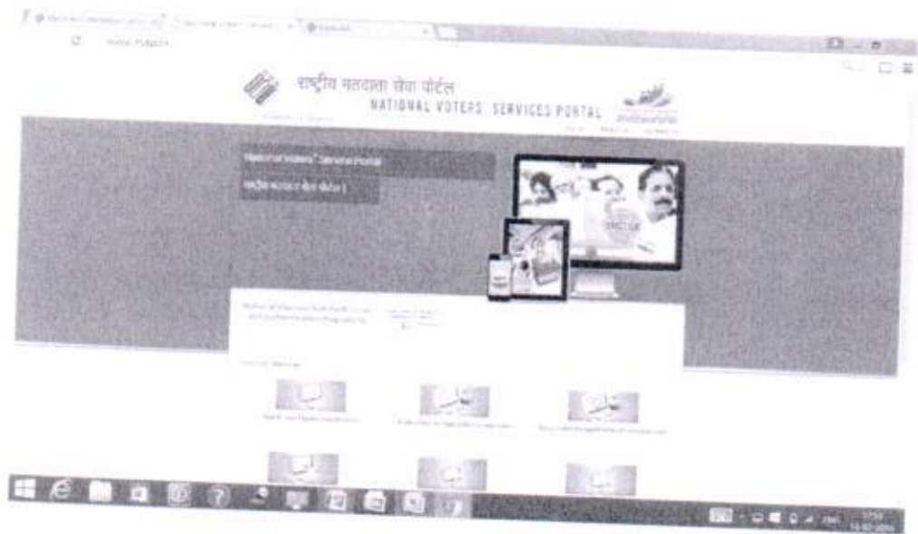
Fig 1.3 nvsp portal 'Home' page