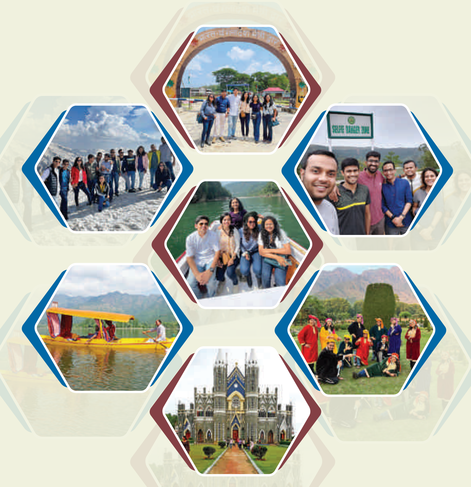
'Incredible India' through the eyes of IFS OTs during their Bharat Darshan