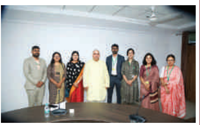
Call on dignitaries during State Attachments (Governors, Chief Ministers & senior officials) by IFS OTs