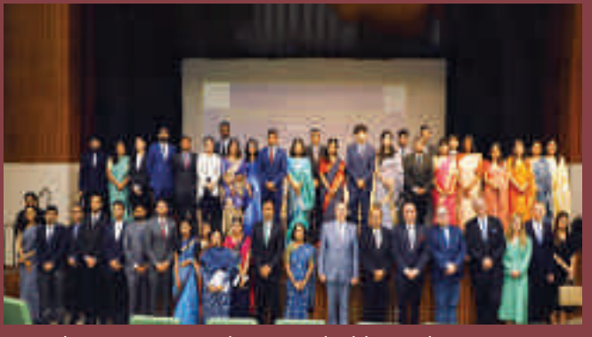
H.E. Mr. Zbigniew Rau, Foreign Minister of Poland visited SSIFS on 25 April 2022 and addressed the IFS OTs and Bhutanese diplomats.