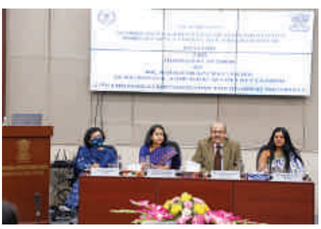
Inaugural session addressed by Dean (SSIFS)