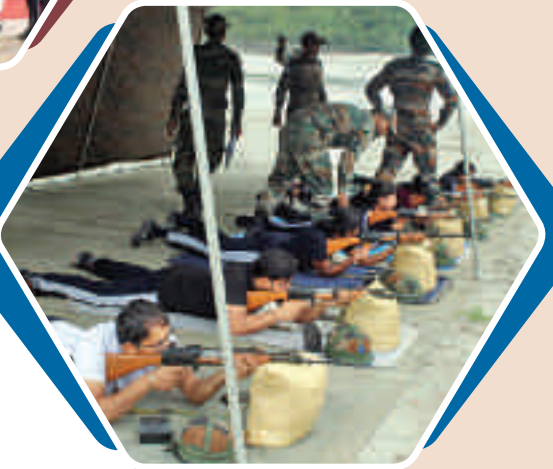
Army Attachment of IFS OTs