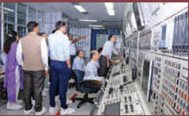
Visit to Department of Atomic Energy, Tarapur Atomic Power Station & Tata Memorial Hospital by IFS OTs