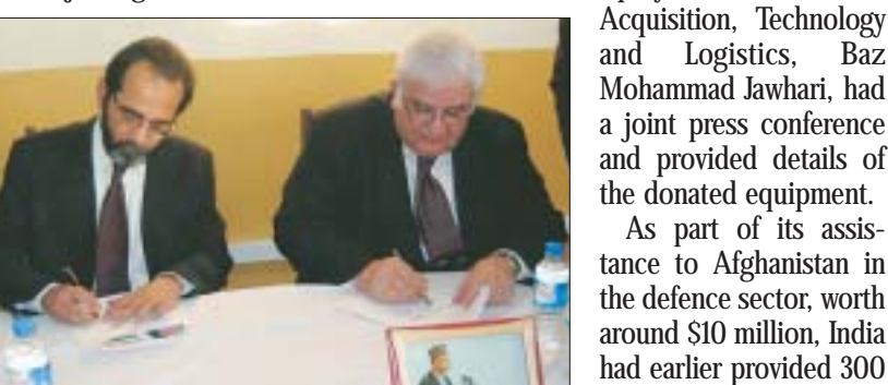
Afghan Defence Minister Abdul Rahim Wardak, right, and Ambassador of India Rakesh Sood, left, signing the documents on donation of the military equipment.

The military equipment donated by India included 2,500 units of Bullet Proof Jackets, 2,500 units of Bullet Proof Helmets, 150 Bullet Proof Observation Towers (Machan), 1,000 sets of Laser Aim Points,