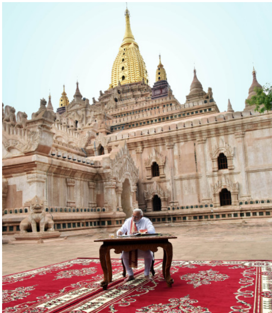
PM Modi signing the visitors book at the Ananda Temple in Bagan during his visit to Myanmar in September, 2017

In the early 1960s, an ASI team visited Nubia to explore, excavate and salvage any ancient artefacts around Afyeh and Tumus and discovered middle and late stone age tools in the process.