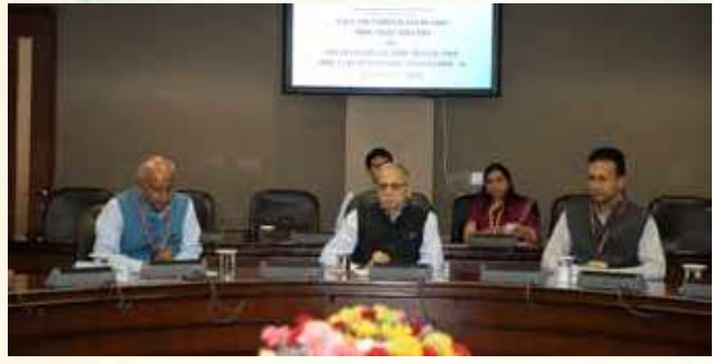
Call on Foreign Secretary