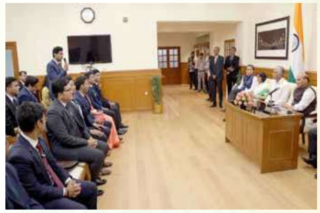
IFS OTs' call on Raksha Mantri