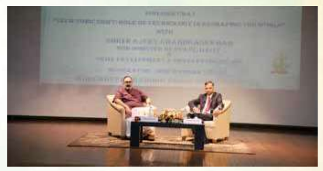
Fireside chat with MOS for MeITY Skill Development & Entrepreneurship