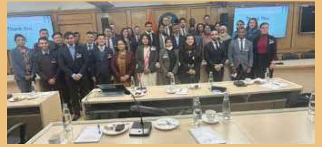
Visit to Election Commission of India