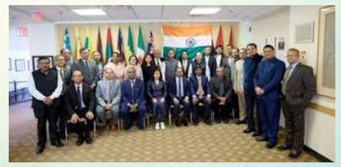
At The Fletcher School