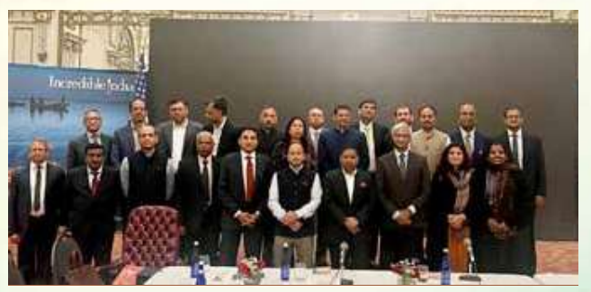
Briefing Session at New York