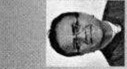
SHRI UM PRAKASH BHANAWAT Hon'ble Agriculture Minister, Haryana

TRANSFORMING HARYANA - PROGRESSING HARYANA