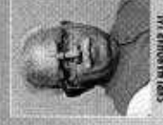
SHRI MANOHAR LAL Hon'ble Chief Minister, Haryana