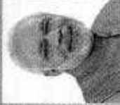
SHRI NAGESHWAR MODI Hon'ble Prime Minister, India