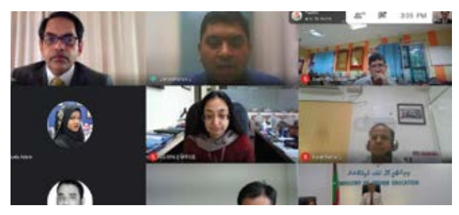
Dr Ibrahim Hassan, Minister of Higher Education, Government of Maldives enthusiastically supported e-ITEC trainings in Maldives along with Mr. Sunjay Sudhir, High Commissioner of India to Maldives and other dignitaries.