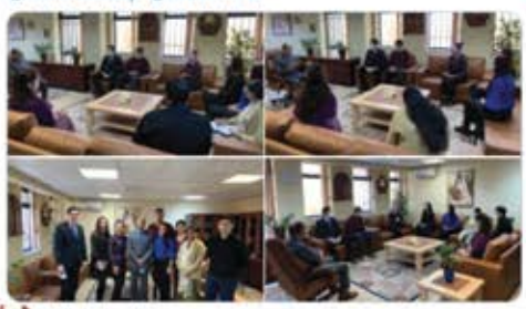
idia in Eswat

Had a productive interaction with the ITEC alumni in Turkmenistan. Exchanged views and took notice of their valuable suggestions. Agreed to set-up an ITEC Alumni Association. Looking forward to more such meetings in future, #ITEC @DrSJaishankar @MOS_MEA warup @MEAIndia