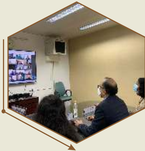
Promotion Related Training Programme for SOs/PSS virtually held from 12-23 July 2021