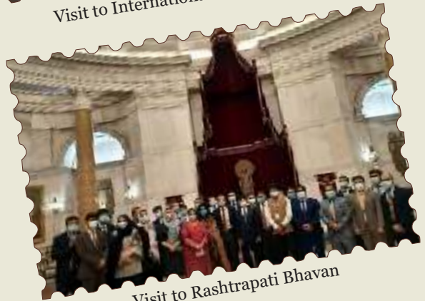
Visit to Rashtrapati Bhavan