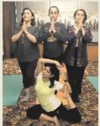
Yoga Session for Afghan Diplomats