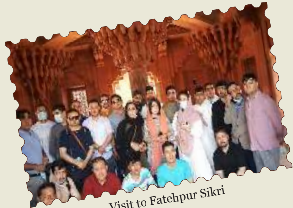
Visit to Fatehpur Sikri