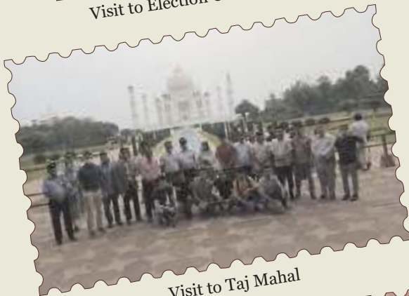
Visit to Taj Mahal