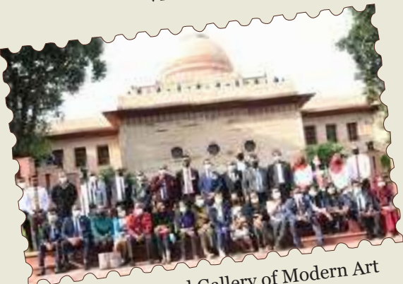
Visit to National Gallery of Modern Art