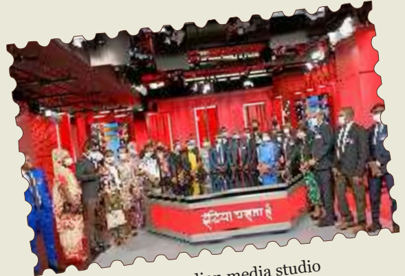
Visit to Indian media studio