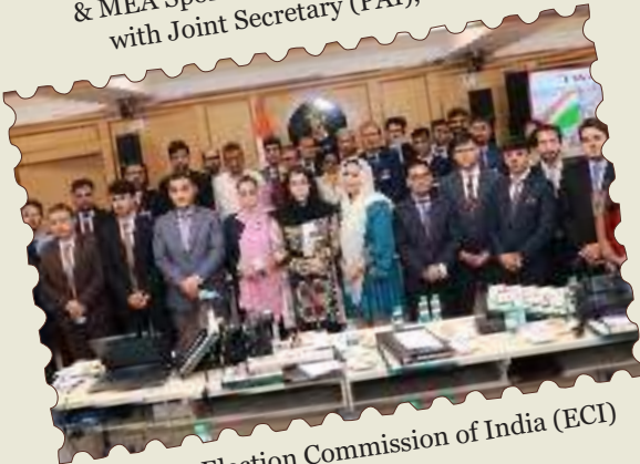
Visit to Election Commission of India (ECI)