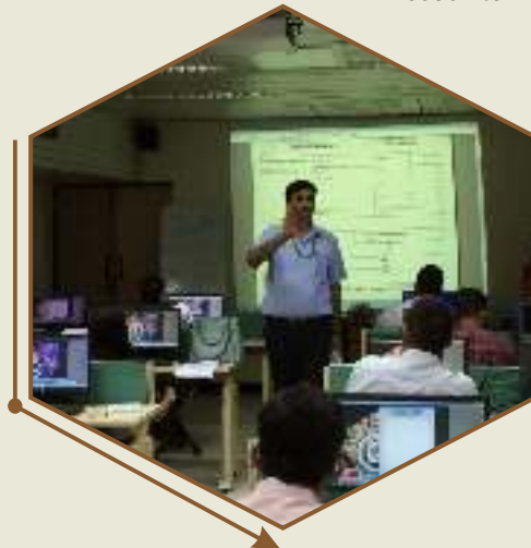
Participants of IMAS undergoing hands-on training in the Computer Lab of SSIFS