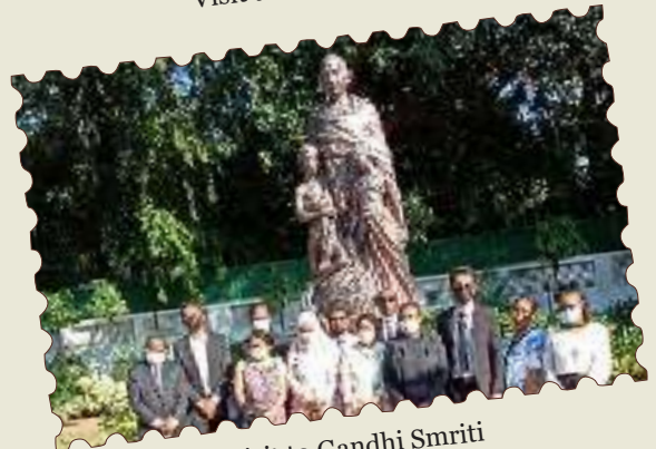
Visit to Gandhi Smriti