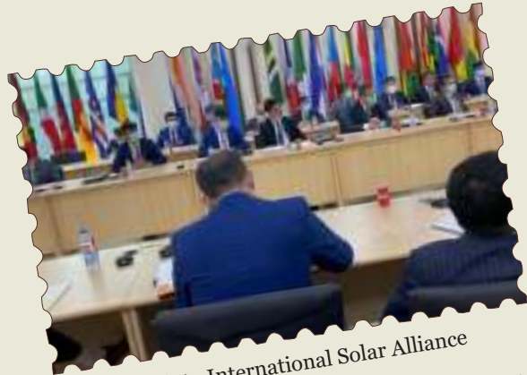
Visit to International Solar Alliance