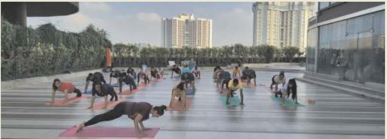
Diplomats from IOR countries participated in the Yoga Session