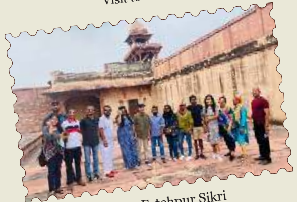
Visit to Fatehpur Sikri