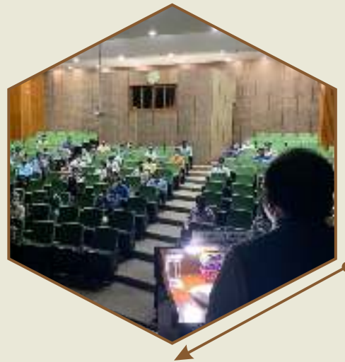
Dean (SSIFS) addressing the participants of Accounts Training Programme