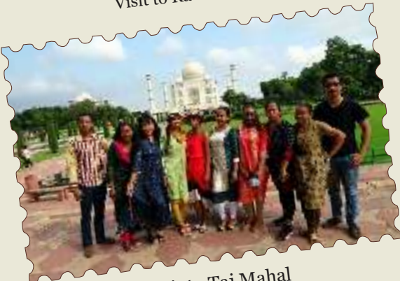
Visit to Taj Mahal