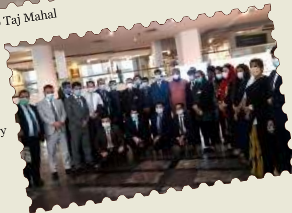
Visit to National Gallery of Modern Art