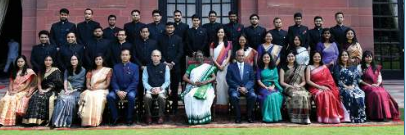
Call on Hon'ble President of India, Smt. Droupadi Murmu