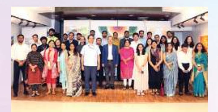
Visit to Indian Council for Cultural Relations