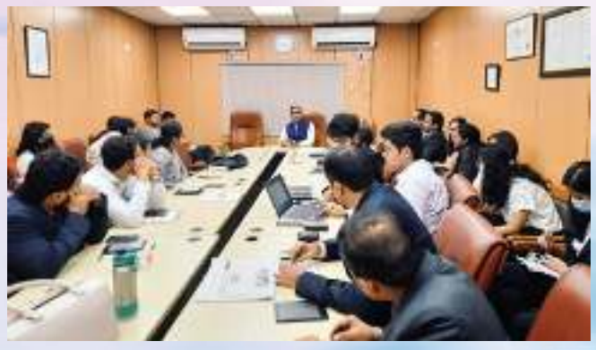
Visit to Patiala House: Briefing on Consular, Passport and Visa matters